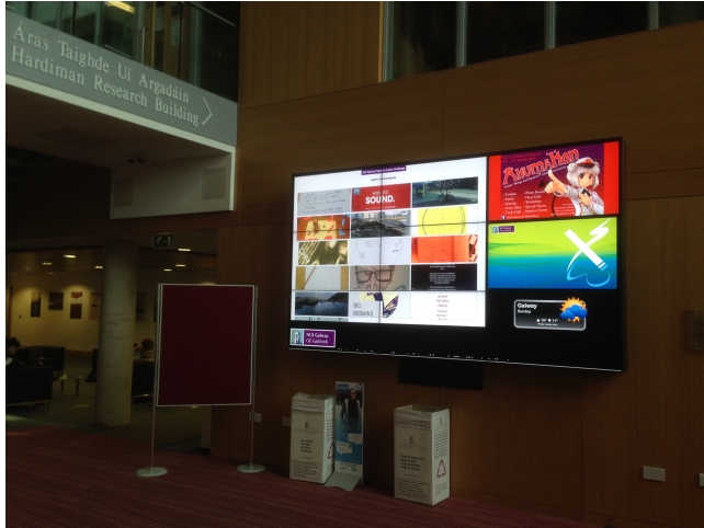
Figure 1. The social wall of creative contributes in the library.

An important element was the daily email digest, which sent registered participants a reminder of the day's prompt. Another important aspect was the large display on a flatscreen wall outside of library, and the showing of the social wall of contributions across all buildings on campus, on digital displays. In this way, the project was shaped by the participants, and how they appropriated the challenge.