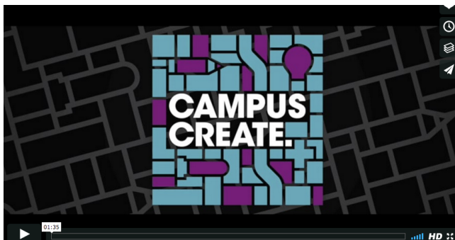
Figure 2. An edited video of campus creates [26] on Vimeo.

From our own play and experimentation at Campus Create the project saw the evolution of a community of networked individuals moving their creative practices into the open on campus. An edited summary of the contributions can be seen in Figure 1's video below.