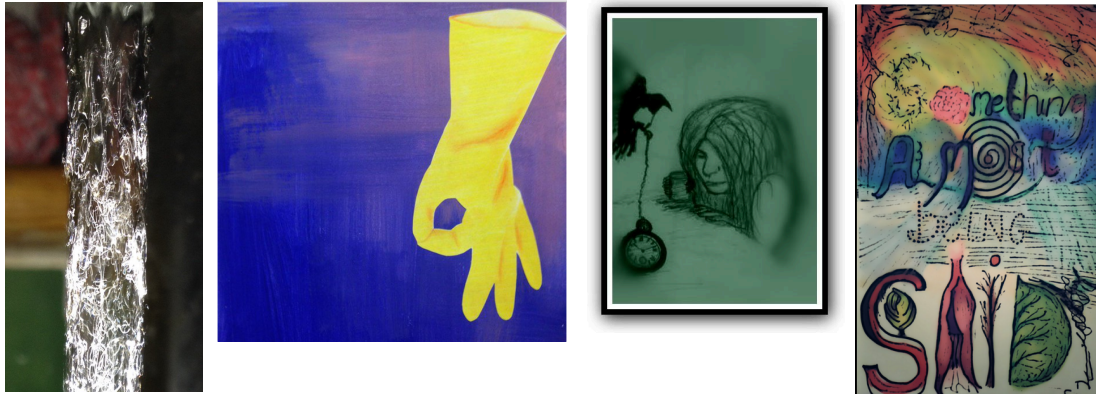
Figure 3. A sample of contributions