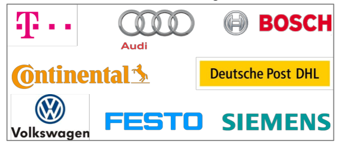
Figure 8: Participants 2016

In 2016 we continued with our 2015 project topic of "Internal Community Management". This year we defined the sub-topics "Create a movement", "Digital Leadership" and "Intercultural Community Management".