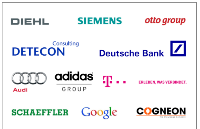
Figure 4: Participants 2012

In 2012 participating companies were sharing good practices around the sub-topics "Adoption of Social Intranets", "Motivating employees in Social Intranets" and "Searching and finding information in Social Intranets".